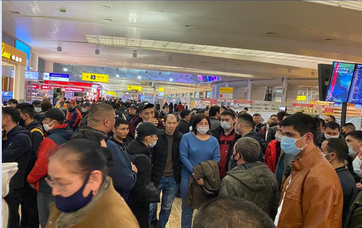
File photo of migrants stranded at Moscow's Sheremetyevo Airport.

*References to Kosovo are in the context of Security Council Resolution 1244/1999