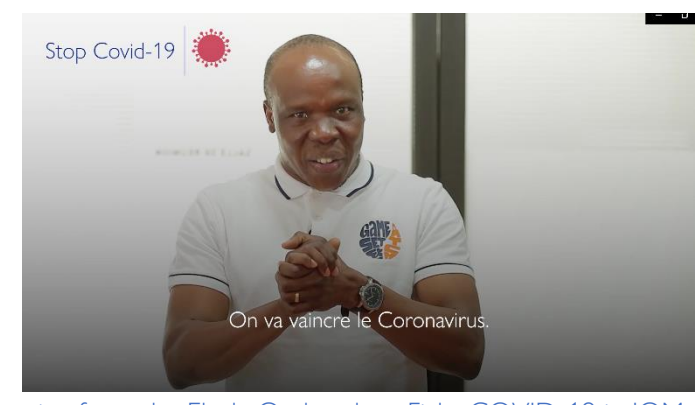
Learning from the Ebola Outbreak to Fight COVID-19 in IOM Sierra Leone

Protégeons-nous. Protégeons les autres. Respectons les gestes barrières.