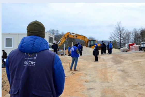
IOM workers on-site at the new 1,000 bed facility for homeless migrants in Bihac, Bosnia and Herzegovina.

was launched 15 April 2020 and can be downloaded here .