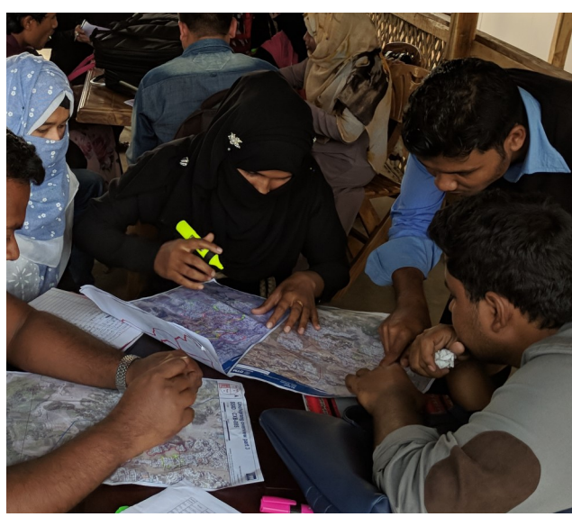
Enumerators marking majhee blocks on paper maps.

At the conclusion of the digitization exercise, GIS data quality processes will be executed upon the dataset to ensure the zones are contiguous, with no gaps or overlaps. NPM and ISCG intend to share the final product with the humanitarian response community via HDX.