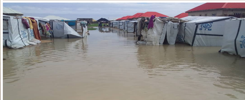
Pictures taken at the site showing damaged shelters and flooded areas.