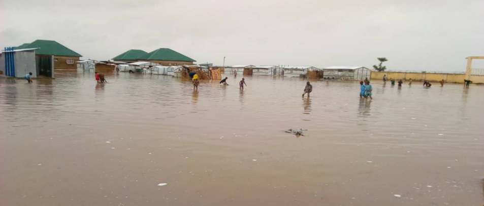
Pictures taken at the site showing damaged shelters and flooded areas.