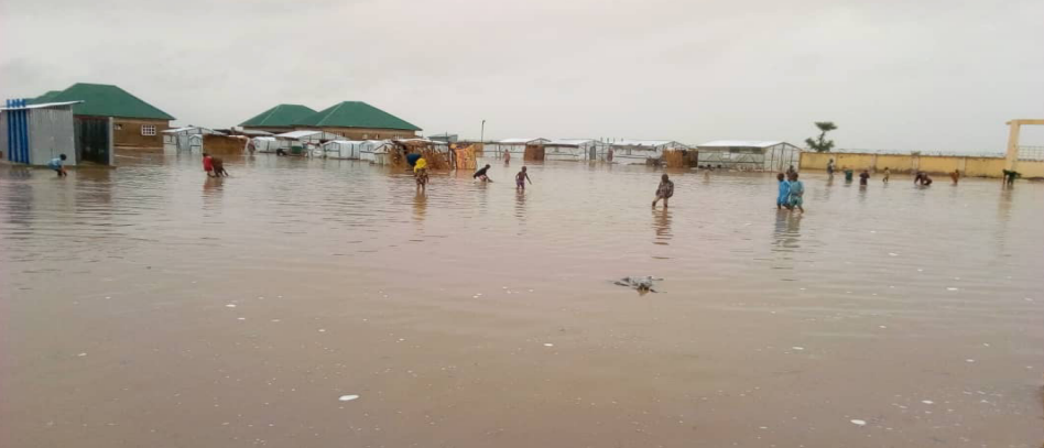
Pictures taken at the site showing damaged shelters and flooded areas.