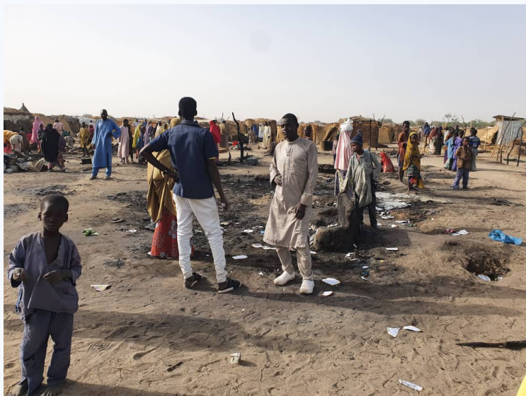
Residents of Waterboard IDP Camp assessing damages after the fire outbreak

At about 2:10 PM on 12th March 2020, a fire incident was reported at Waterboard IDP Camp affecting a total number of 62 individuals (14 households). It was reported that 10 emergency shelters were damaged in the incident, properties belonging to the affected individuals destroyed and a few biometric ID cards burnt. A fatality was recorded in the fire disaster with another person suffering first degree burns and is currently receiving treatment at Alima Clinic.