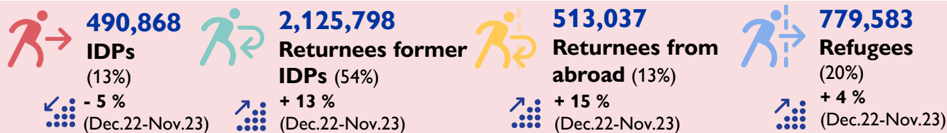
Number of returnees former IDPs, per year