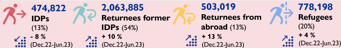
Number of returnees former IDPs, per year