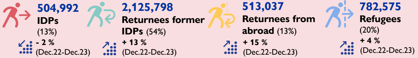
Number of returnees former IDPs, per year