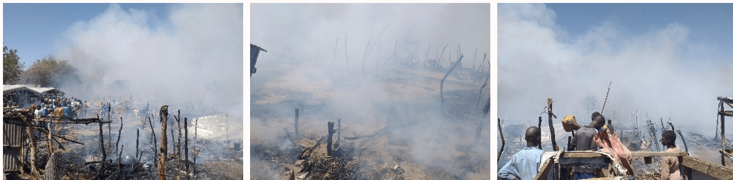
Scenes from the fire outbreak at GSSSS Camp Monguno