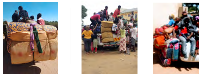
IDPs arriving in Mueda and Montepuez districts