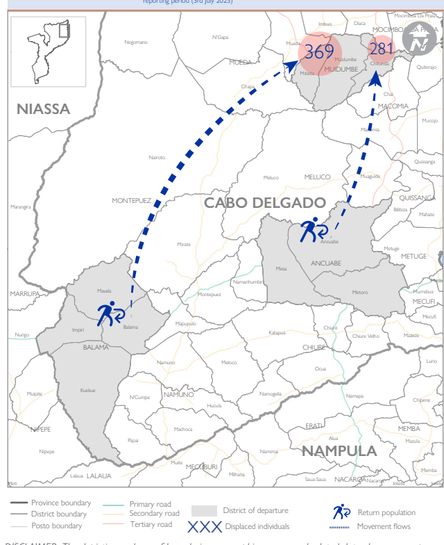
territory, endorsement or acceptance of such boundaries by IOM.

Intended return movements to places of origin from Balama and Ancuabe districts (sede) from July 3rd triggered 650 individual departures from Balama and Namuno to Muidumbe (Chitunda and Miengueleua) district. An estimate of 116 Intended returning persons were identified with vulnerabilities. Within this reporting period, all of the recorded movements were displaced for the second time.