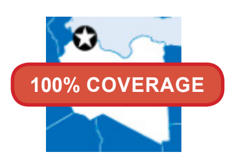
100% of MUNICIPALITIES