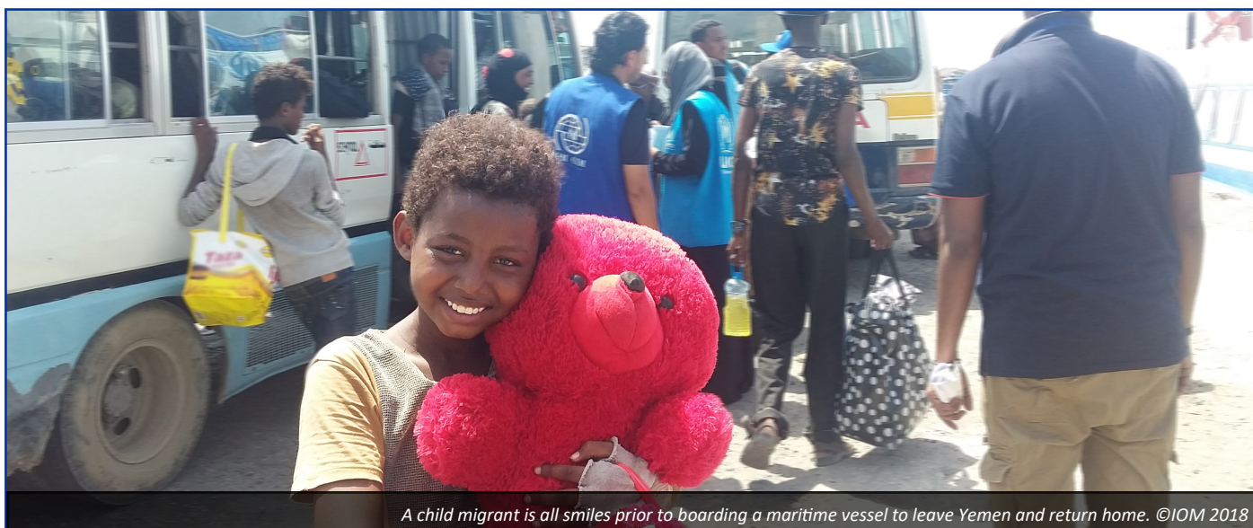
A child migrant is all smiles prior to boarding a maritime vessel to leave Yemen and return home.