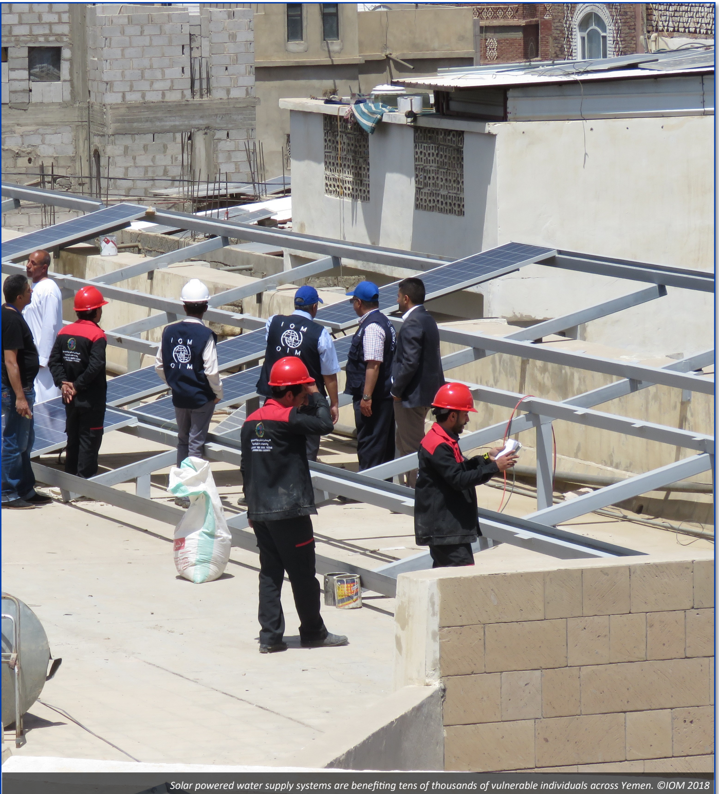
Solar powered water supply systems are benefiting tens of thousands of vulnerable individuals across Yemen.

IOM provides emergency WASH assistance to the most vulnerable, and restores and maintains water and sanitation systems towards the improvement of public health. This is achieved by provision of rehabilitation and maintenance of water supply systems, capacity building of WASH stakeholders, water trucking to IDPs, and hygiene promotion activities. During the reporting week, 344,000 liters of water was trucked to different water points, hospitals, and