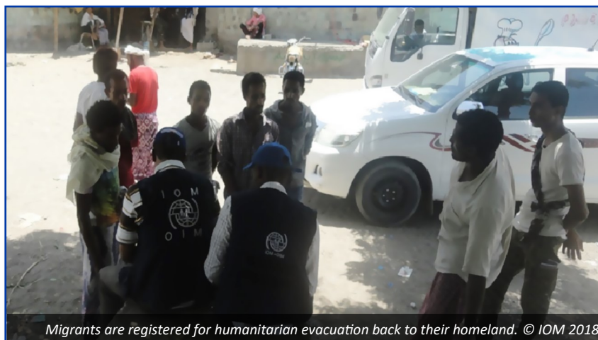
Migrants are registered for humanitarian evacuation back to their homeland.

A total of 2,461 conflict-affected children (757 girls and 1,704 boys) benefitted from a range of activities—including acting, art, sports, and orientation on recycling and personal hygiene—provided in 24 Child-Friendly Spaces (CFSs) in Sana’a and Aden. In addition, 8 girls and 19 boys were referred to focused PSS. Due to school holidays and temporary closure for security reasons, 24 out of the 34 IOM-supported CFSs are currently operational.