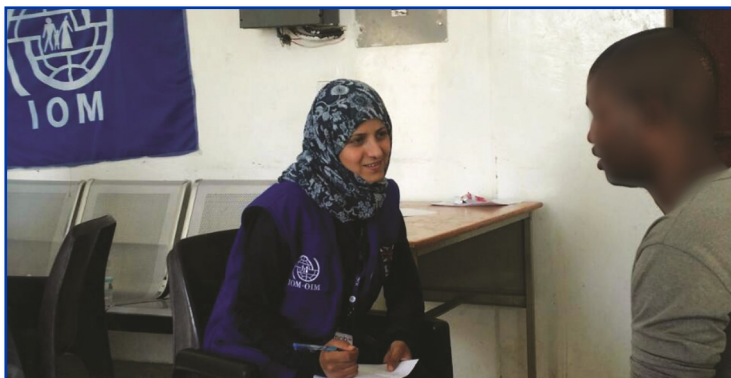
An IOM psychologist in an individual session with a migrant in Sana'a.

To support the surmounting needs within the health sector, IOM continues expanding access for the affected populations to healthcare services and provides medical and technical support to healthcare centres and hospitals. IOM provided healthcare assistance to 13,754 IDPs and other conflict affected Yemenis and 895 migrants during the reporting week. Healthcare services – provided through 61 IOM-supported healthcare facilities across Yemen –