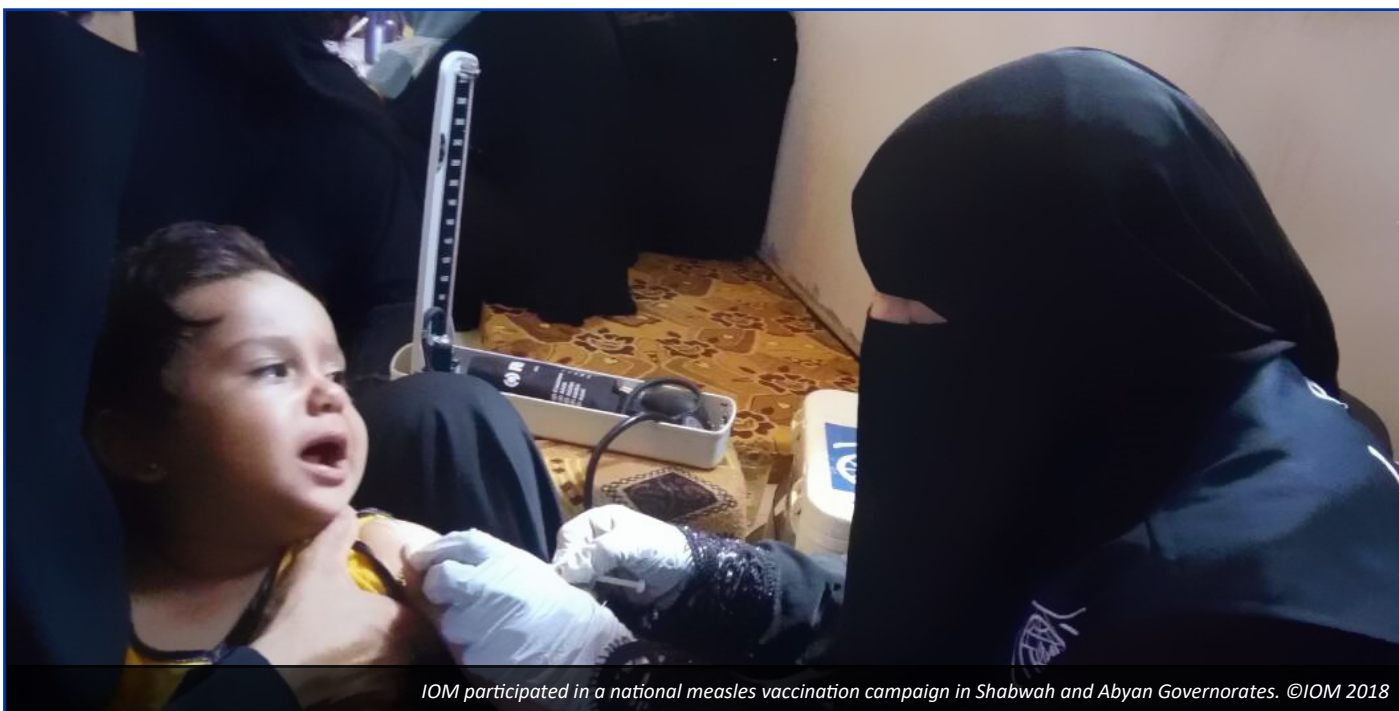
IOM participated in a national measles vaccination campaign in Shabwah and Abyan Governorates.

One cholera case was confirmed using a rapid test, among 160 suspected cholera/AWD cases (43 girls, 53 boys, 37 women, and 27 men) that were treated in Ibb through DTCs and ORPs as part of cholera response. IOM participated in a national measles vaccination campaign in Shabwah and Abyan Governorates during the reporting week and provided treatment and referral services for confirmed cases through its mobile health teams in the area. Focused psychosocial support services (PSS) was provided to 219 children and their parents—including 11 girls, 68 boys, 24 women, and 116 men)—through individual and group sessions conducted in Child Friendly Spaces (CFSs) in Sana'a and Aden. As part of supporting national programmes in the implementation of HIV/AIDS, TB, and Malaria activities in Yemen, 55,000 Long Lasting Insecticide Treated Nets (LLINs) were distributed among 21,600 host community and 2,138 IDP households in Taizz and Hodeidah Governorates. This is part of plans to distribute over 1.7 million LLINs in 2018, with over 800,539 LLINs already distributed to date. Additionally, IOM supported with conducting Malaria Assessment Survey among IDPs in Aden and Al Maharah Governorates, with similar assessments already conducted in Taizz, Hajjah, Al-Hudaydah, Marib, Amran, and Lahj Governorates.