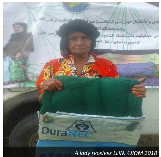
A lady receives LLIN.

IOM is managing the Global Fund (GF) Middle East Response (MER) Project in Yemen with an aim to support national programmes in the implementation of HIV/AIDS, TB, and Malaria activities in Yemen. In support of the National Malaria Control Programme (NMCP), a total of 306,250 Long Lasting Insecticide Treated Nets (LLINs) were distributed in the Hodeidah Governorate in the reporting week, with the 25 April–2 May LLINs Campaign aiming to distribute a total of 470,300 LLINs in high Malaria prone districts of Jabl rass, Algarahi, Bait alfakih, Altuhaita, Almansoria, Aldoraihmi, Almarawia, Bajil, and Alhajaila.