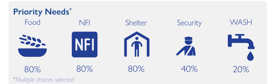
Fig. 2. Most needed assistance