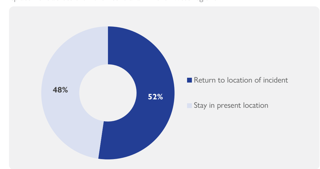
Fig. 1. Future intentions

Nigeria's north-central and north-west zones are afflicted with a multi-dimensional crisis. Long-standing tensions between ethnic and religious groups often result in attacks and banditry or hirabah. These attacks involve kidnapping and grand larceny along major highways by criminal groups. During the past years, the crisis accelerated and has resulted in widespread displacement across the north-central and north-west regions.