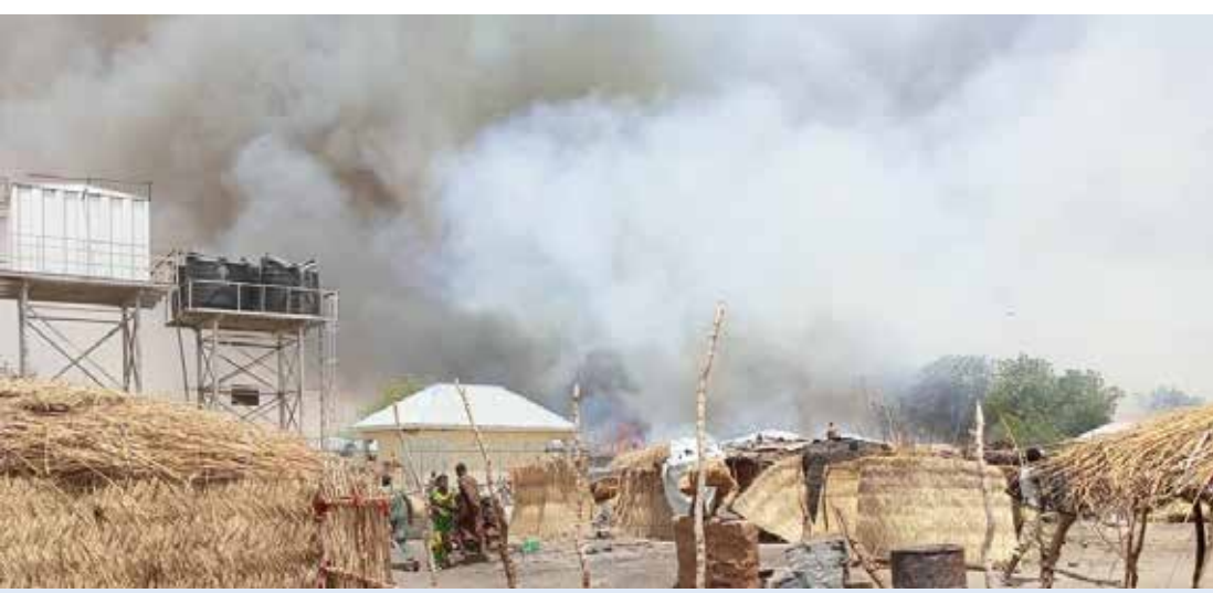
Damaged shelters after the fire outbreak in Government Girls' Secondary School camp in Mafa LGA