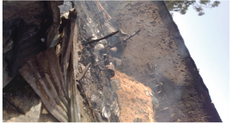
Aftermath of the fire outbreak at NRC 1 & 2 Camp, Monguno, Borno State.

A fire broke out in Kuya and NRC 1&2 camps in Monguno Local Government Area (LGA), Borno state, on 11 and 13 February 2023, and many internally displaced persons (IDPs) were further displaced. Most of the affected people lost their shelter and personal belongings including, biometric cards and food ration cards. No injuries or fatalities were reported, the cause of the fire was unknown.