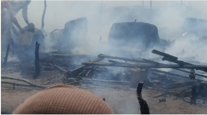
Aftermath of the fire outbreak at Kuya Camp, Monguno, Borno State.