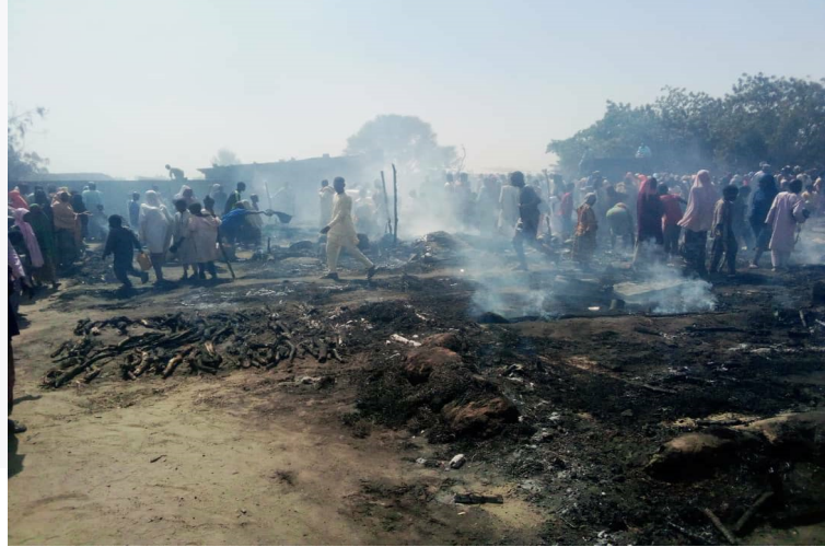
Residents of NRC 1 & 2 Camp assessing the damages after the fire outbreak

Four separate fire outbreaks at Fulatari Camp, Government Science Senior Secondary School (GSSSS) Camp Monguno, NRC 1 & 2 Camp and Waterboard Camp have left 703 IDPs homeless, as their properties and belongings are destroyed.