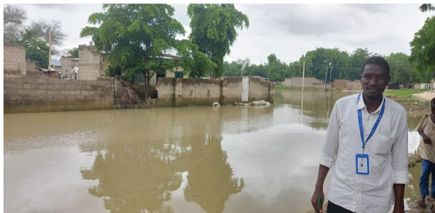
Flooded area in Damagum, Fune LGA