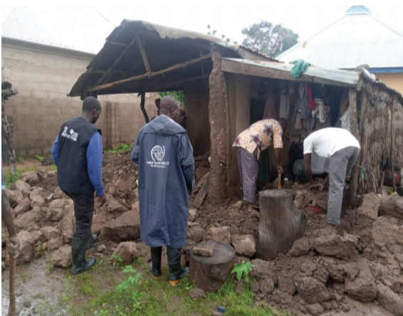
A Damaged House in Hyambula, Lamurde LGA