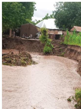
Flooded area in Gulak LGA