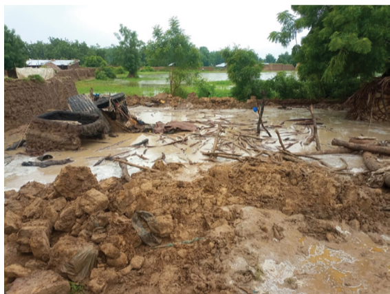
A damaged house in Dagona, Bade LGA