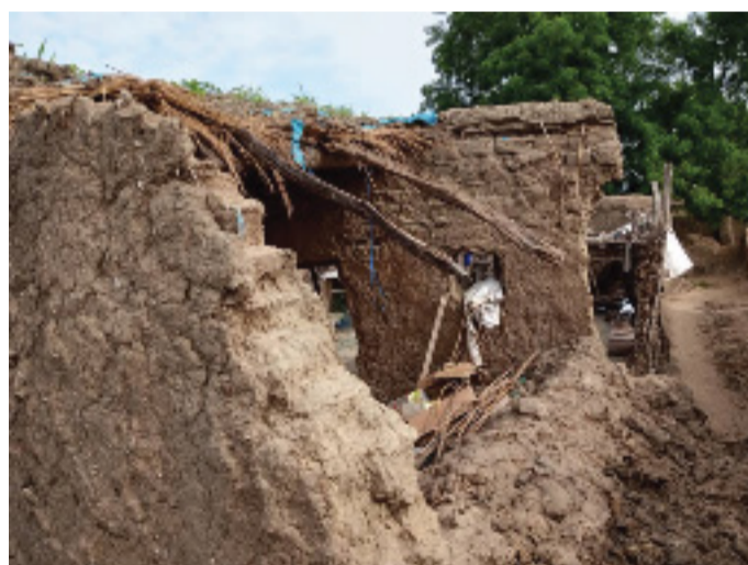
A Damaged House in Gujba, Gujba LGA