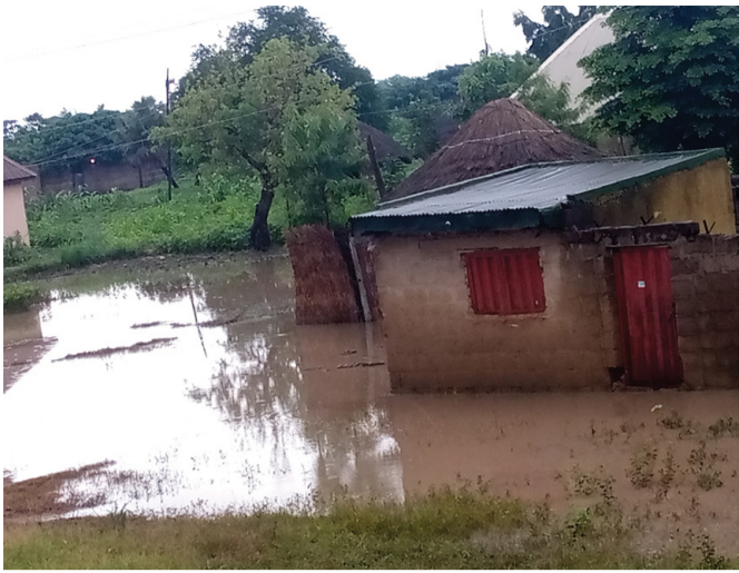
Flooded area in Imburu, Numan LGA