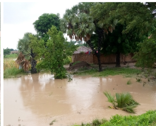
Flooded area in Bilachi, Numan LGA