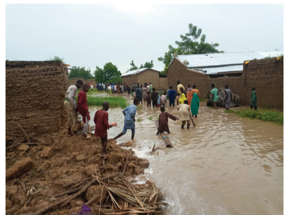
Flooded area in Dagona, Bade LGA