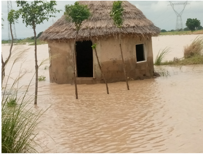
Flooded area in Imburu, Numan LGA