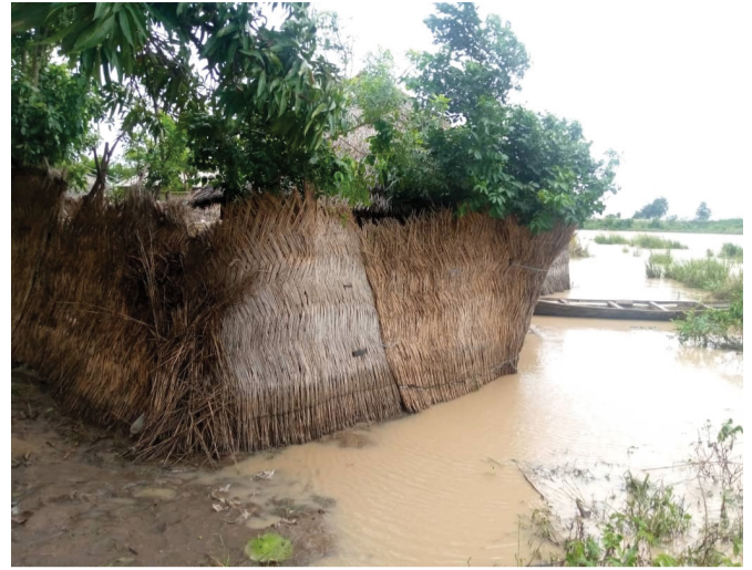
Flooded area in Anguwan Maikano, Shelleng LGA