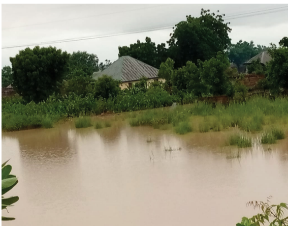
Flooded area in Ngbakowo, Lamurde LGA