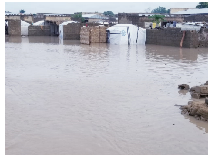
Flooded area in Banki, Bama LGA