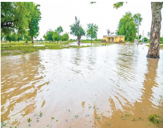
Flooded area in Bumsa, Gulani LGA