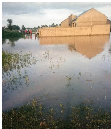
Flooded areas in Masalachin Idi in Jama'are LGA