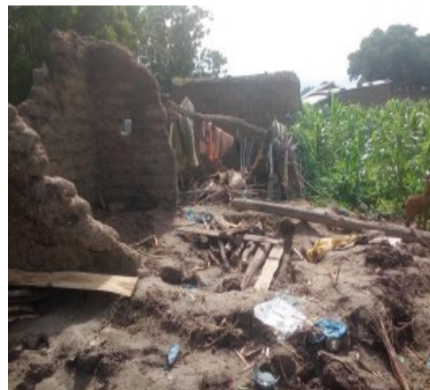
A damaged house in Filing shagari in Ganjuwa LGA Eroded area in Katanga in Warji LGA