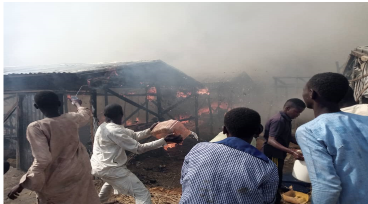
Residents of Waterboard Camp putting out the fire