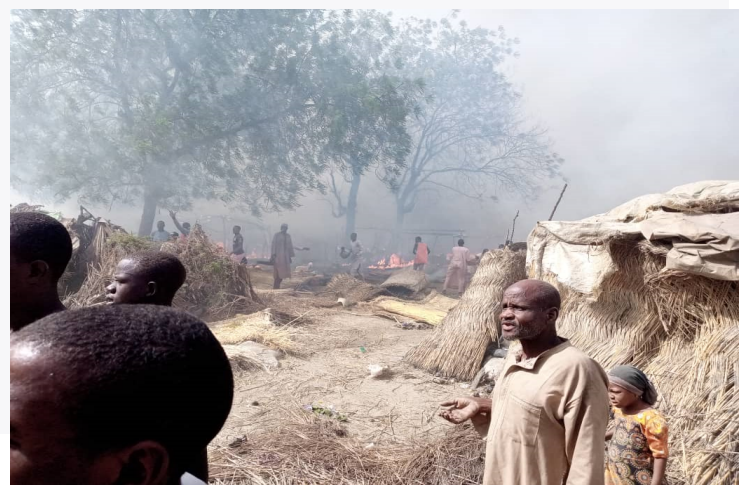
Residents of Fulatari Camp and Waterboard Camp attempting to put out fire