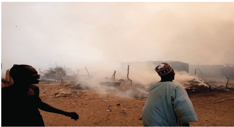
Affected area in Fulatari Camp after fire outbreak