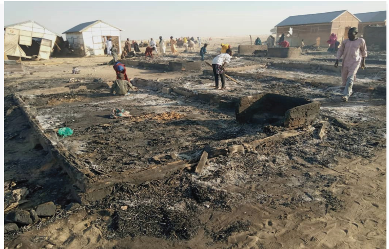
Residents of Kuya Primary School Camp assessing the damages after the fire outbreak

On 31 May 2021 at 2:30PM, there was a fire outbreak at Kuya Primary School Camp that reportedly destroyed shelters and belongings of numerous IDP households.