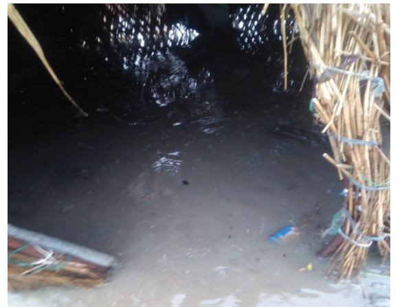
Most Needed Assistance. FIG 1.1