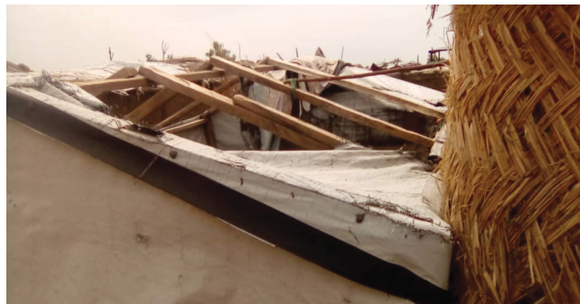
Above is a Picture taken at the site showing a damaged Shelter.