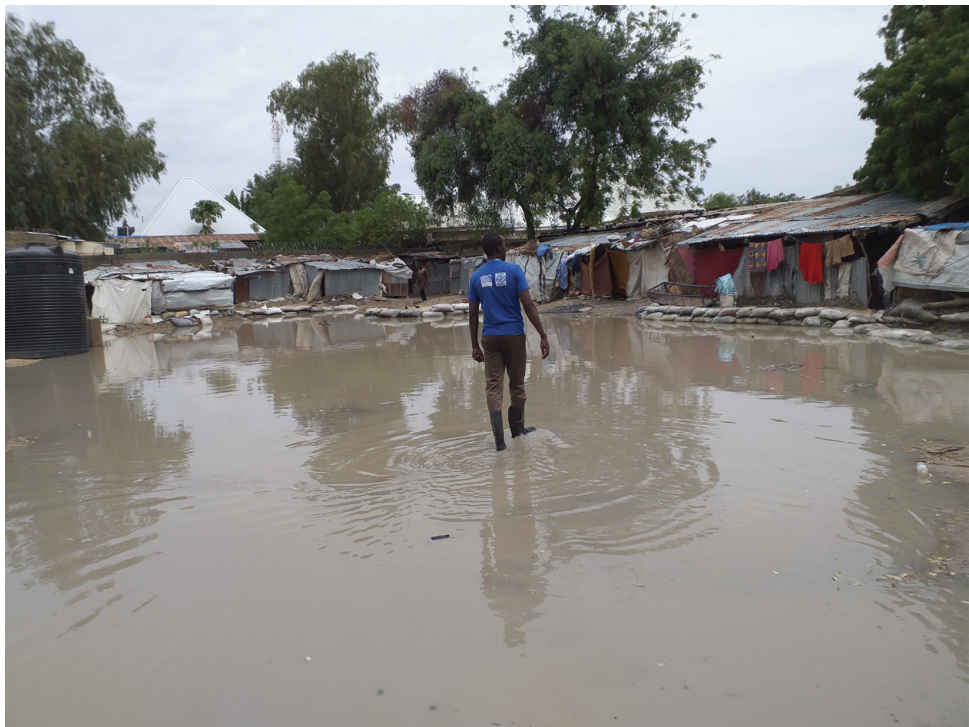
Above is a Picture taken at the site showing the flooded areas in Yajiwa Camp.