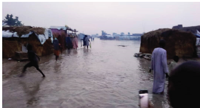
Above is a Picture taken at the site showing flooded areas.