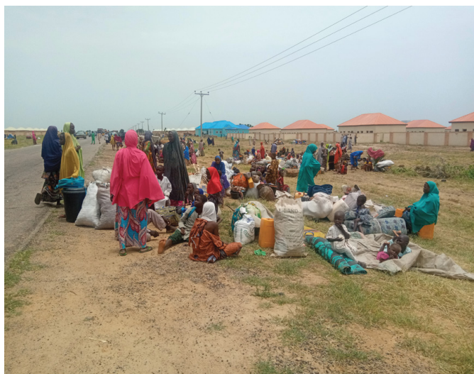
Above are pictures taken at departure and at arrival in Shuwari Kalari.