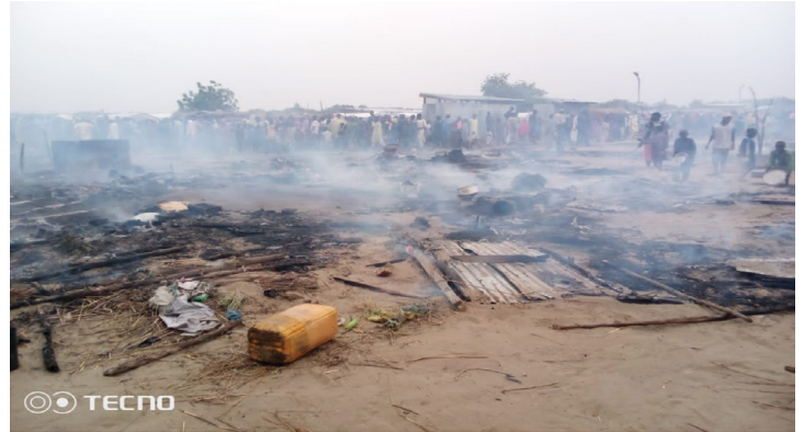
Aftermath of the fire outbreak at Water Board Camp, Monguno, Borno state.

On April 16 and 24, several fire outbreaks were reported in Water Board Camp in Monguno Local Government Area (LGA), Borno state. The fire outbreak affected a total of 232 individuals and destroyed 45 makeshift shelters. The affected individuals included 141 children, 46 women and 45 men. The majority of those affected by the fire outbreak lost their personal items in the fire, including biometric cards and food ration cards. The fire outbreak was caused by the wind spreading cooking fires. One death was reported as a result of the fire outbreak.