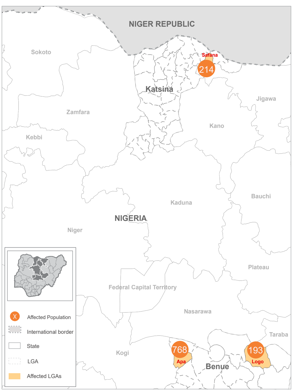
The map is for illustration purposes only. The depiction and use of boundaries, geographic names and related data shown are not warranted to be error free nor do they imply judgment on the legal status of any territory, or any endorsement or acceptance of such boundaries by IOM.