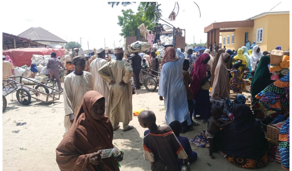
A cross section of relocated IDPs, Photo © IOM-DTM/2021