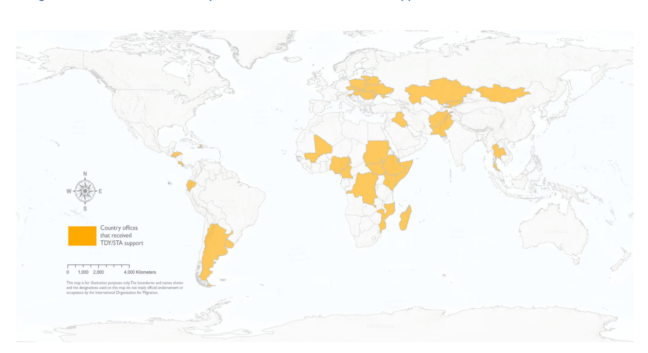
Figure 2: Locations of the country offices that received TDY/STA support in 2022

In 2022, 38 country offices received TDY/STA support, from global teams and other IOM missions, in which various support was provided in functions such as reporting, analysis and software development.