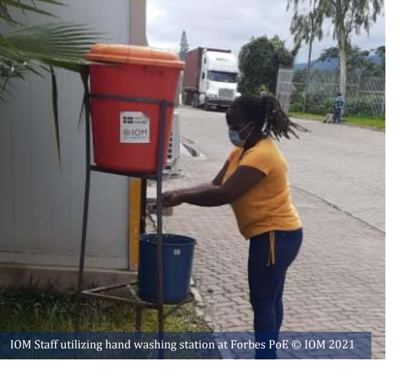
(2i) Beitbridge-Mutare-Beira (2ii) Beira-Mutare-Masvingo

Mutare is an important transit point for long distance travellers, especially traders to access neighbouring towns (Harare, Masvingo, Bulawayo). Traders of commercial goods, majority of whom come from and reside in Manicaland, Harare and Masvingo provinces transit to Mutare before heading to Chimoio or Beira, resulting in long distance movement across multiple cities and towns with interactions with migrants.