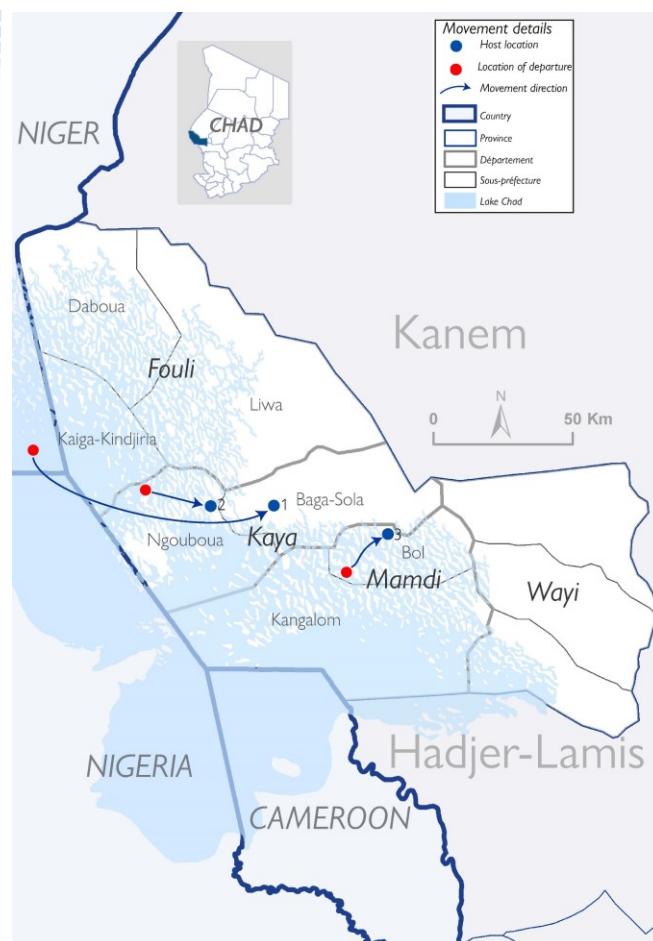
This map is for illustration purposes only. The depiction and use of boundaries, geographic names and related data shown on maps and included in this report are not warranted to be error free nor do they imply judgment on the legal status of any territory, or any endorsement or acceptance of such boundaries by IOM.