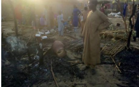
Fire at Boudoumari