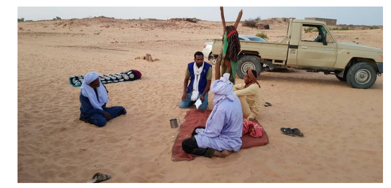
Photos: IOM, June 2019. IOM Emergency tracking team visiting IDP families in Ghat and surrounding areas.