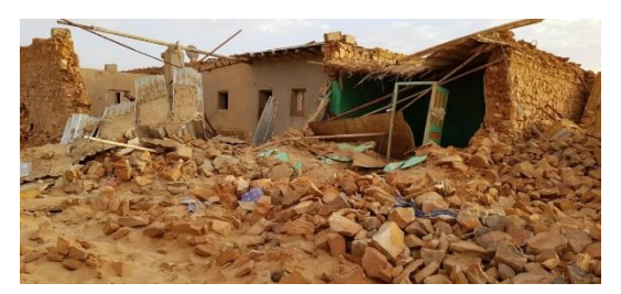
Photo: IOM, June 2019. IOM Emergency tracking team surveying flood affected-area.

Infrastructure: Although roads were reported to be open for the delivery of goods, infrastructure inside Ghat has been adversely affected by the floods. Apart from damage to roads and buildings, the electricity grid as well as telecommunication infrastructure were heavily affected, leading to frequent outages.