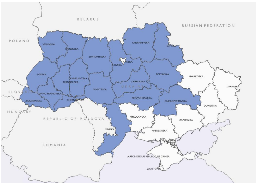
Map 1. DTM Round 6 Oblast level coverage in Kyivska, Dnipropetrovska, Poltavska, Vinnytska, Zakarpatska, Cherkaska, Lvivska, Khmelnytska, Ivano-Frankivska, Ternopilka, Odeska, Kirovohradska, Chernivetska, Zhytomyrska, Chernihivska, Volynska, Rivnenska and Sumska oblasts.

For more insights on displacement trends in Ukraine see IOM Ukraine's general population survey which provides national and macro-region level estimates and insights on human mobility and needs using phone surveys and a randomized sampling approach. This area baseline report complements the general population survey by highlighting the distribution of internally displaced population within oblasts at the hromada level.