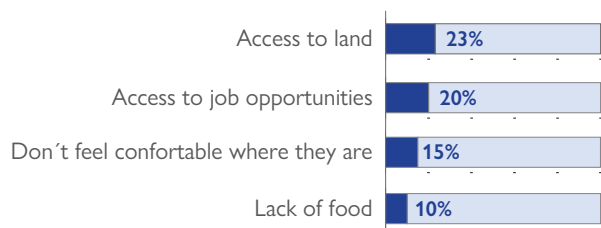
Graph 4. Main reasons for the return

According to the respondents, the main reason of return is to have access to land (23%), and 10% said they are going back because of the lack of food. These reasons were followed by the need to have means of subsistence and access to job opportunities (20%). Only 15% responded they don't feel comfortable where they are. When asked what they need to return, the majority of families said they need help with reconstruction materials (23%), followed by help with transportation costs to return (22%), and the reestablishment of normality (22%) and basic services such as health and education (16%).