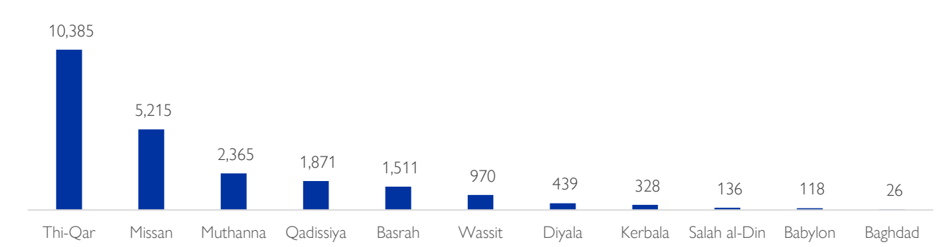
Figure 1: Number of families displaced due to climactic factors by governorate of displacement

The number of families in climate-induced displacement expanded in this round as key informants referred RART teams to previously unassessed locations of displacement. In total, 34 new locations were added this round, particularly in Muthanna. The number of locations and climate-displaced families is expected to increase each round as the network of key informants expands. However, the continual increase in families also suggests such movements are permanent, rather than temporary.