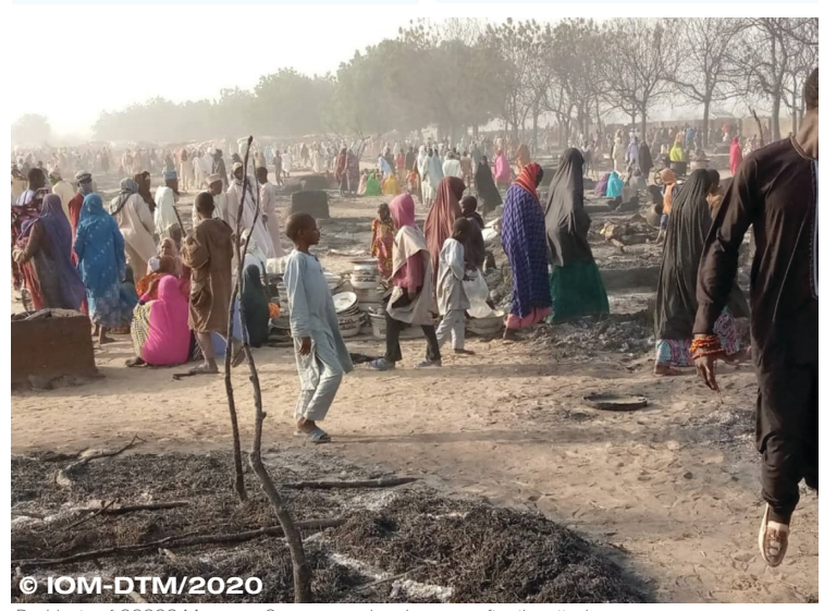
Residents of GSSSS Monguno Camp assessing damages after the attack

An attack on GSSSS Monguno Camp has rendered an estimated 2,728 Internally Displaced Persons (628 households) homeless, after the destruction of more than 300 shelters and properties belonging to the affected individuals.