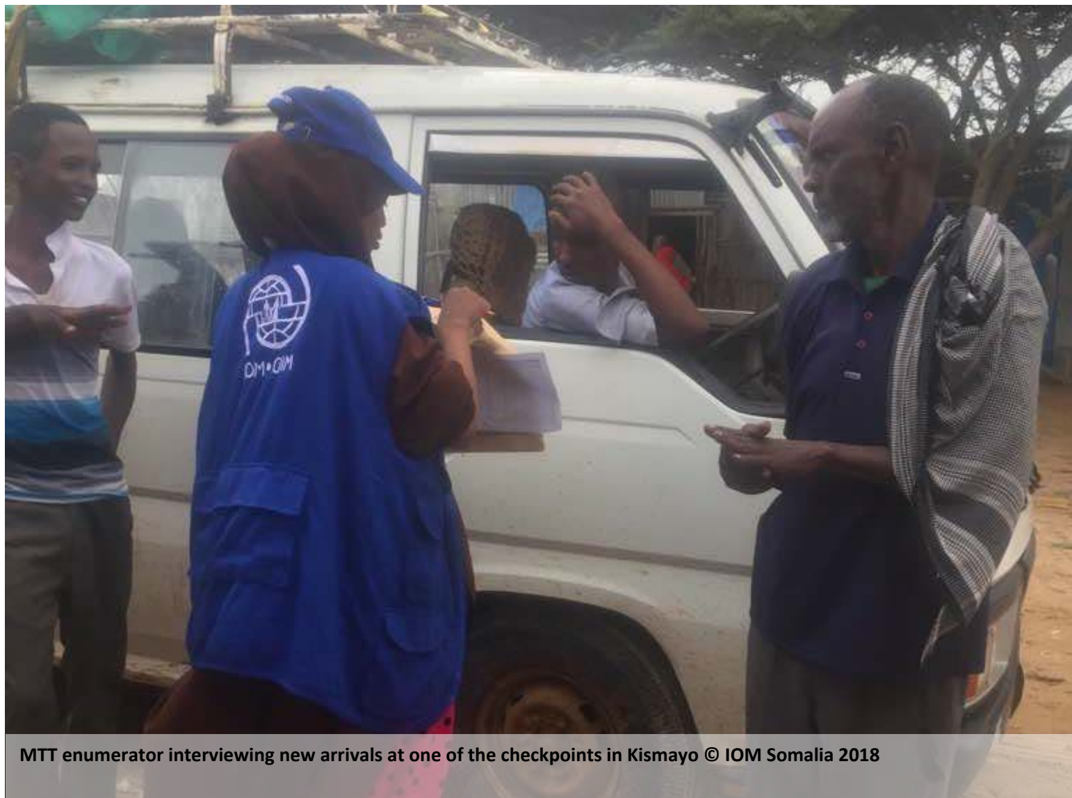
MTT enumerator interviewing new arrivals at one of the checkpoints in Kismayo

MTT aims to complement existing information management products on displacements and movements in Kismayo, by providing site level specific data on population movements on a regular basis, to assist agencies operating in sites and settlements with key information on: demographics of movement, area of origin, area of return/onward movement, reasons for movement and movement trends over time.