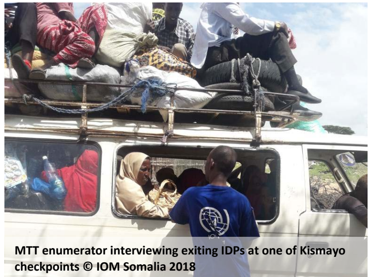
MTT enumerator interviewing exiting IDPs at one of Kismayo checkpoints