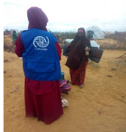
Figure 1: MTT enumerator interviewing new arrivals at IDP comp