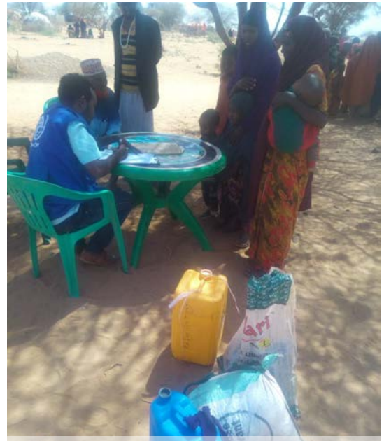
MTT enumerator interviewing new arrivals in IDP site