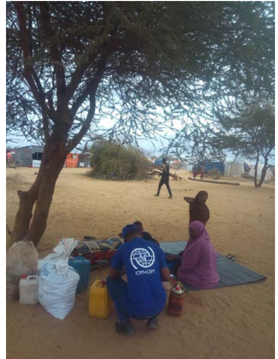
MTT enumerator interviewing new entries