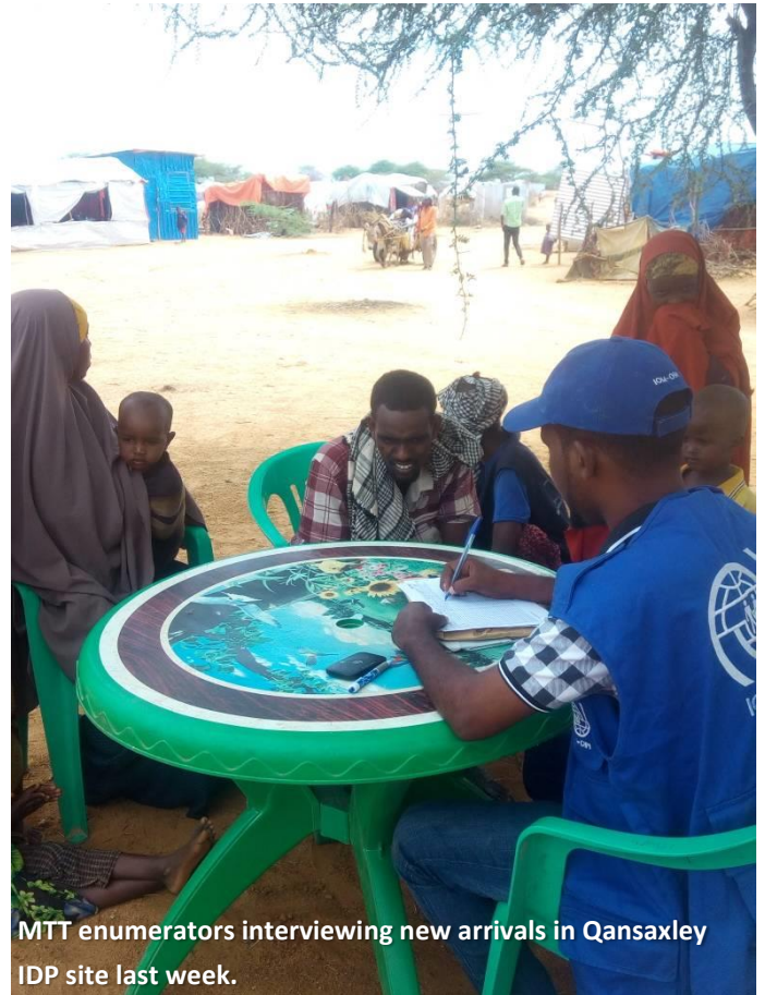
MTT enumerators interviewing new arrivals in Qansaxley IDP site last week.