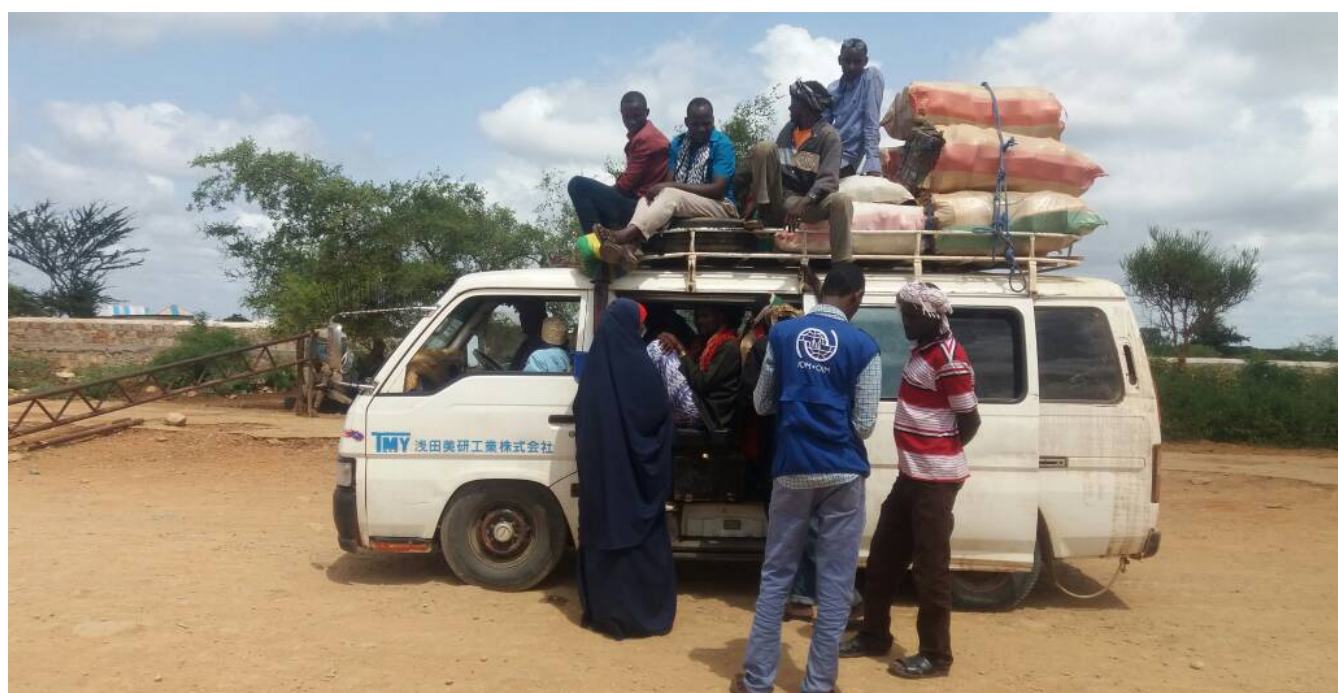
IOM MTT enumerators identifying IDPs exiting from IDP sites and conducting interviews with the heads of household.