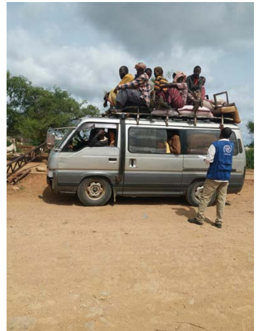
MTT enumerator interviews IDPs arriving in Baidoa last week.