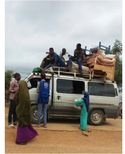
MTT enumerator interviews IDPs arriving in Baidoa last week.

Almost all those leaving Baidoa reported they are going to manage their farms (83%) and 17% reported they are going to join their families in the place of origin. Those exiting were from the IDPs sites of Afmadow (50%), Arsham (33%), Banow (10%) and Moora Gabay (7%). 50% of the exits were returning to Baidoa district, (33%) Dinsoor district, (10%) Buur Hakaba district and (7%) Hudur district. All of the families said they intend to return to the IDP sites in the future.