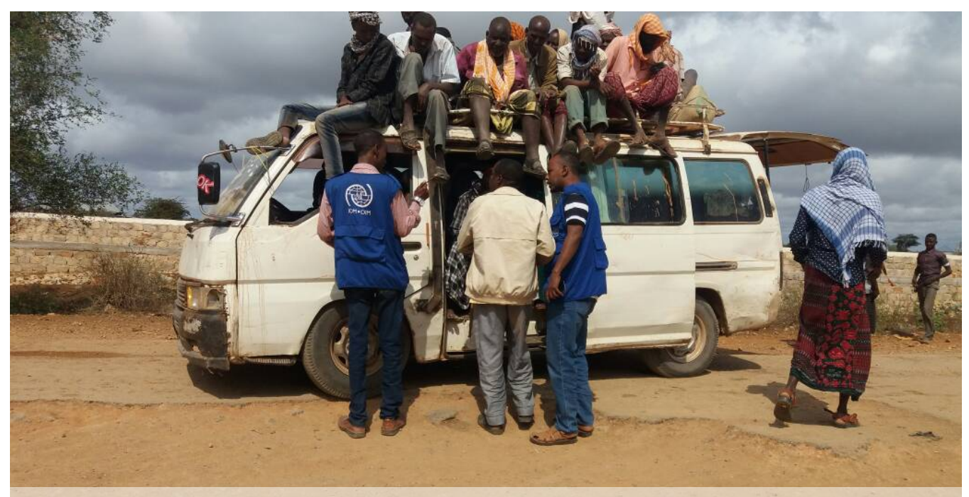
IOM MTT enumerators identifying IDPs exiting from IDP sites and conducting interviews with the heads of household.

MTT aims to complement existing information management products on displacements and movements in Baidoa, by providing site level specific data on population movements on a regular basis, to assist agencies operating in sites and settlements with key information on: demographics of movement, area of origin, area of return/onward movement, reasons for movement and movement trends over time.