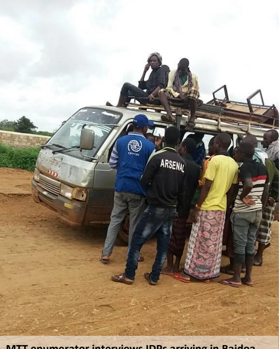
MTT enumerator interviews IDPs arriving in Baidoa last week.

All of the exits this week said that they were leaving to manage their farms, since the Gu seasonal rains had begun. 45% of those exiting were from Buula Ciir site, 18% from Aliyow Maraley, 15% from Mora Gabey, 11% from Boodan and the remainder 11% exiting from the IDP site of Fanoole. All were returning to Baidoa District of Bay region, and all of the families said they intend to return back to the IDP sites in Baidoa.