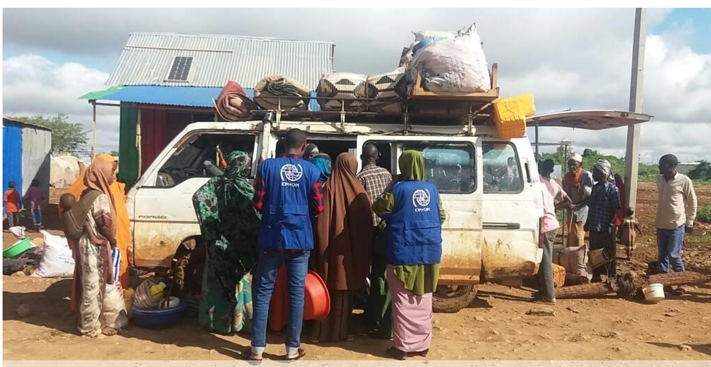
IOM MTT enumerators identify IDP exiting from the IDP sites and conduct interviews with the heads of household.

MTT aims to complement existing information management products on displacements and movements in Baidoa, by providing site level specific data on population movements on a regular basis, to assist agencies operating in sites and settlements with key information on: demographics of movement, area of origin, area of return/onward movement, reasons for movement and movement trends over time.