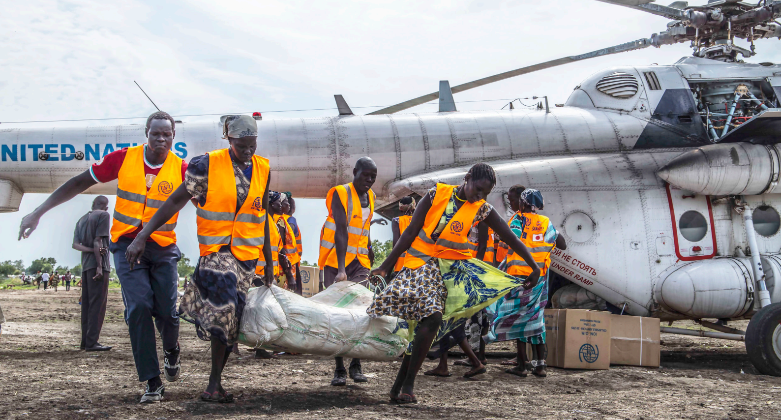
Arrival of emergency shelter items in Pibor, GPAA