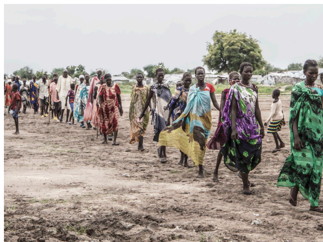
Majority of Gumruk residents displaced by the fighting are women and the elderly

As the situation in the Greater Pibor Administrative Area stabilizes following a wave of violence that displaced over 20,000 individuals between 7 and 13 May, IOM's Displacement Tracking Matrix (DTM) team continued to monitor returns from displacement sites in Pibor town. Out of the 7,015 IDPs estimated across nine sites on 23 May, only 820 remained on 31 May. Pibor Boys Primary School and the former Special Action for Life Transformation (SALT) and Livewell compounds no longer host any IDPs, while only one household remains at Pibor Girls Primary School. The school authorities at Pibor Boys and Pibor Girls are now preparing the premises to resume teaching activities. Most of the IDPs who were sheltering at these locations returned to Gumruk, while a small number joined relatives among the host community or moved to the collective sites in Kundako and Lukurnyang. Based on findings from community group discussion, the majority of the IDPs who remain at Pibor Nursery School, Lukurnyang and Kundako intend to remain in Pibor town as they fear further insecurity in Gumruk.