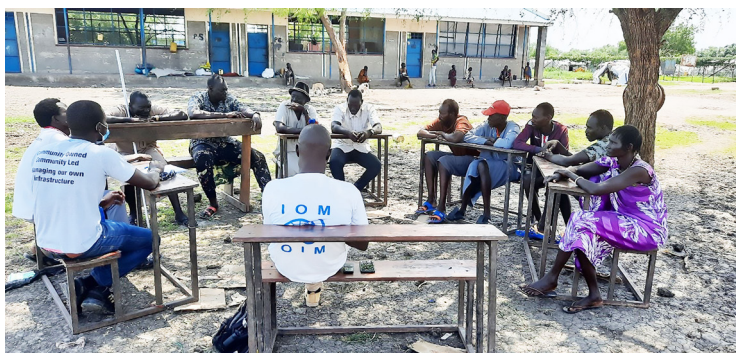
Pibor community leadership meeting

CCCM's mobile response team continues to respond to the ongoing needs of IDPs in Pibor. In collaboration with RRC, IOM strengthened community engagement by identifying leaders, including women and youth, from among the IDP community to support in continued communication with communities. The CCCM team established complaints and feedback (CFM) desks to receive and address issues and respond to community concerns. The desks resolved a large volume of complaints and inquiries during the recent shelter and non-food items (S-NFI) distribution. Prior to the distribution, the CCCM team hosted a town hall meeting in conjunction with local authorities to share information