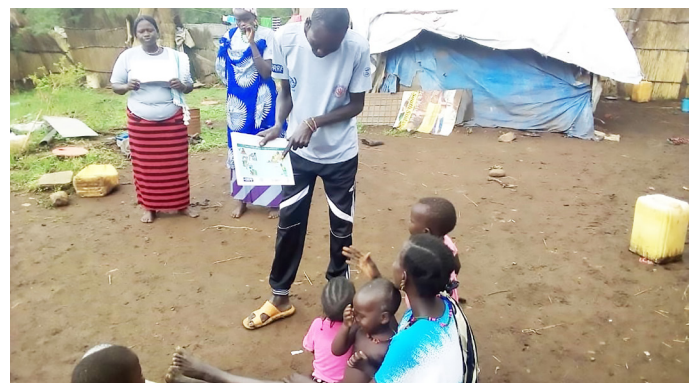
A Hygiene promoter showing a beneficiary with her kids a poster illustrating safe disposal of excreta at Boma