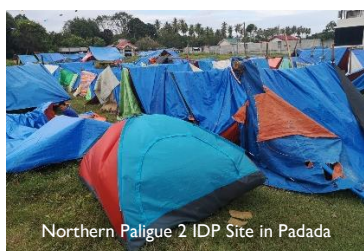
Northern Paligue 2 IDP Site in Padada