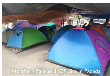
Northern Paligue 3 IDP Site in Padada