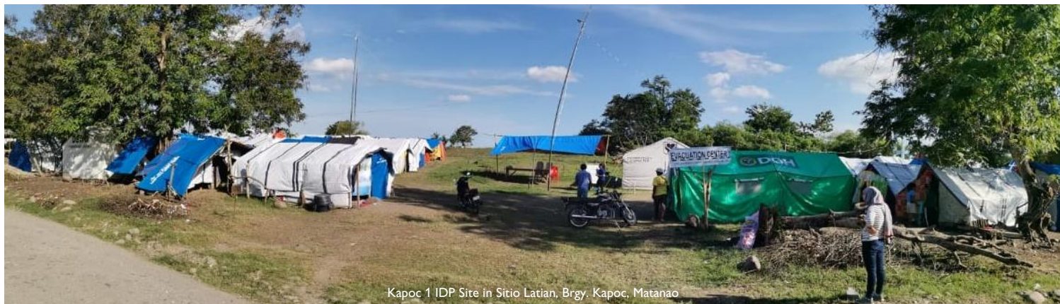
Kapoc 1 IDP Site in Sitio Latian, Brgy. Kapoc, Matanao