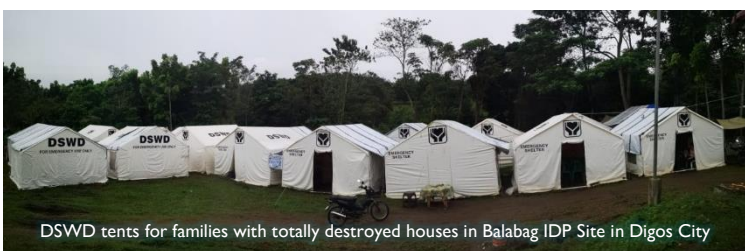
DSWD tents for families with totally destroyed houses in Balabag IDP Site in Digos City